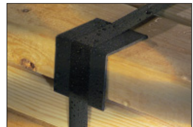
Extruded VGuard® is ideal for protection in outdoor warehousing such as lumber yards.