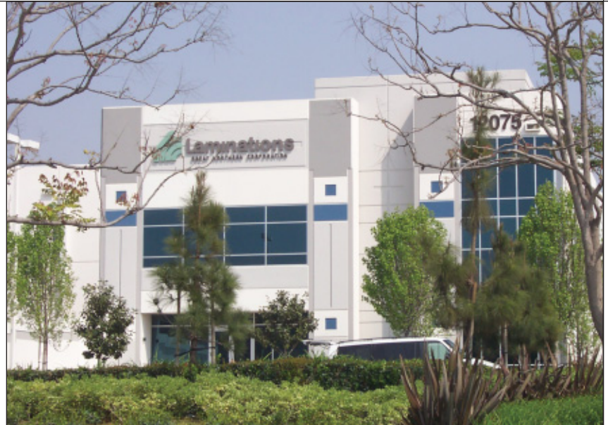
The new West facility, located in Fontana, Calif., will increase production efficiencies for improved quality and service.