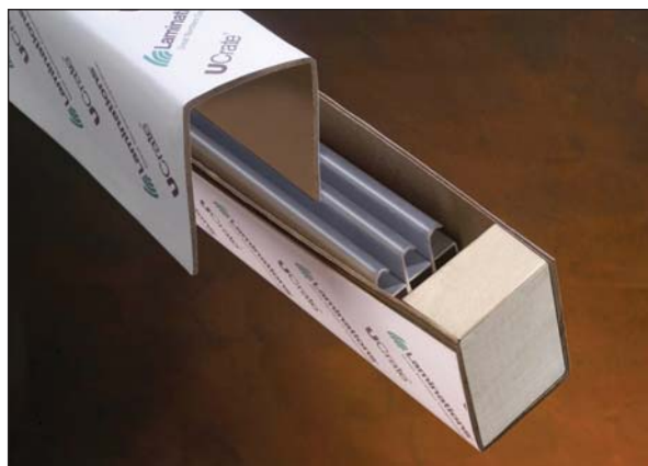
UCrate is ideal for protecting long, narrow products such as metal and plastic extrusions.

UCrate offers many advantages over traditional packaging methods. It provides an ideal alternative to wood because it is lighter weight, eliminates the risk of bug infestation, and is safer because it contains no splinters. It is stackable and top loading, which speeds packing/unpacking time and simplifies storage as compared to end-loading, hard-to-stack options like tubes.