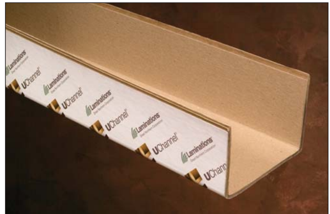
UChannel helped decrease Quality Carton's damage rate from 3% to under 1%.

"When one of these packages is dropped on the ground, the impact of 70 pounds on that three-inch edge is significant. We needed additional materials that would absorb that impact, not just on the first drop but on any subsequent drops as well," Quinn said. "Also, there was very little lateral strength on one of those six-foot panels, so they had the potential of snapping during transit."