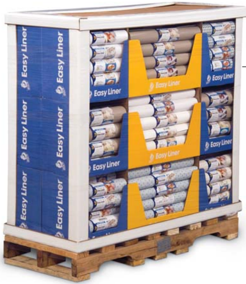
Laminations featured a Display-Ready Pallet that utilizes patented PF PalletTop®.