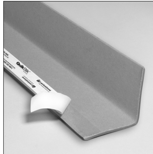
QuikStik is available in a range of adhesive strengths to meet the needs of your application.

Using QuikStik can also double as a quality control signal that the skid is considered inspected and complete, and that it is ready for final wrapping and shipment.