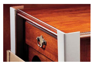
The coating gently cushions, grips and guards against surface damage during shipping, handling and storage.