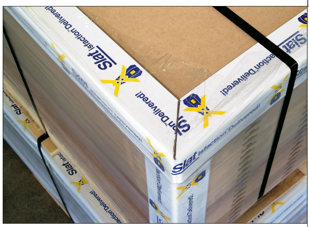
Durable, cost-effective PF PalletTops are much lighter and less bulky than traditional wooden pallet tops. This makes them easier for employees to lift, safer for employees to handle and less costly to ship.

PF PalletTops are a smart alternative to expensive, hard-to-dispose-of wood pallet tops. Made by riveting two pieces of notched VBoard® together, PF PalletTop unfolds easily to form a sturdy square or rectangular shape to fit the tops, sides or bottoms of palletized loads to protect them from shipping and strapping damage.