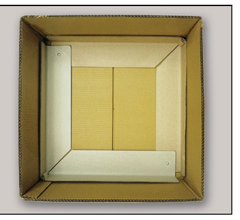
PF PalletTop also offers a simple, effective method of additional reinforcement for interior packaging.