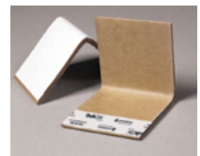
QuikStik is also available in a cost effective VGard strap protector format