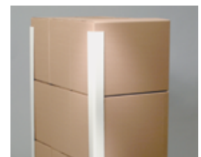
QuikStik offers enough stickiness to get pallet loads of product from the prepping area to the stretch wrapper or bander