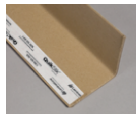
QuikStik features an easy-to-remove release liner