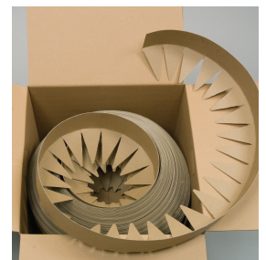
Pre-bent, evenly spaced, sequential pieces allow for quick and easy application to products