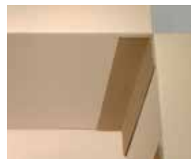
QuikStik stays in place inside the box so your product can be easily loaded