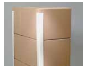
QuikStik offers enough stickiness to get pallet loads of product from the prepping area to the stretch wrapper or bander