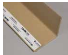
QuikStik features an easy-to-remove release liner