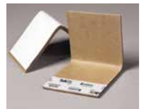
QuikStik is also available in a cost effective VGard strap protector format