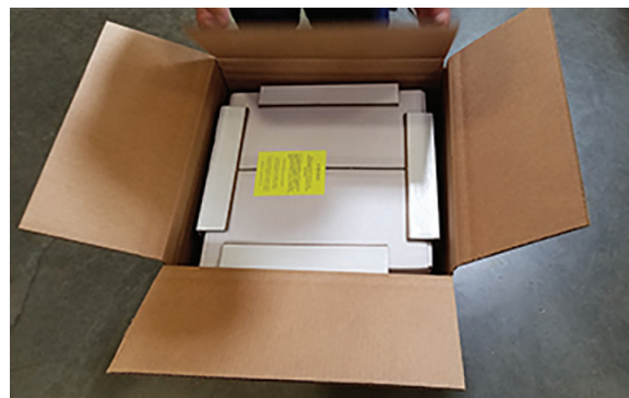
VBoard used inside the box to add structural integrity to packaging