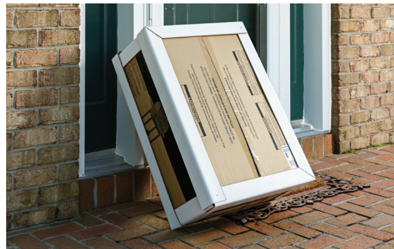
VBoard ensures that high value purchases arrive undamaged and looking good