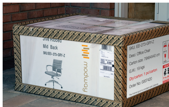
VBoard used outside of the package to protect from warehouse to doorstep