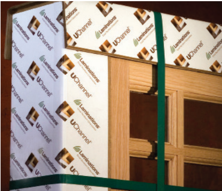
UChannel® is sustainable packaging that provides highly effective protection without excess packaging.

UChannel® offers a highly durable, very cost-effective option that safely protects windows and doors until they arrive at their final destination. Its single-piece construction can be formed to provide a wide variety of widths and leg lengths, offering the ultimate in customized choices for window and door edge protection.