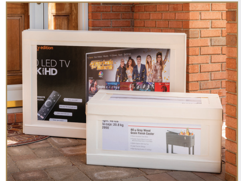
Valuable Electronics and Heavy Boxed Items