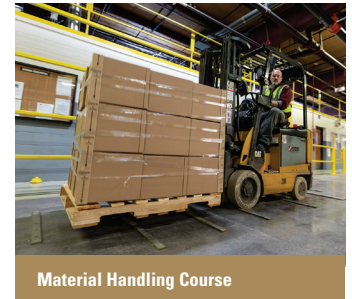
Material Handling Course