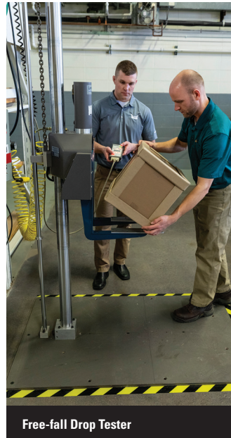
Free-fall Drop Tester